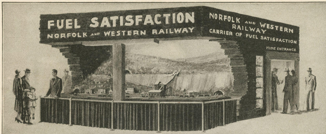
THE NORFOLK AND WESTERN EXHIBIT AT A CENTURY OF PROGRESS EXPOSITION

You and your friends are cordially invited to visit the FUEL SATISFACTION EXHIBIT of the NORFOLK AND WESTERN RAILWAY in the General Exhibits Building A CENTURY OF PROGRESS International Exposition