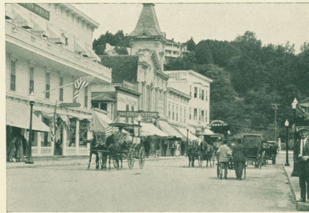
At historic Mackinac Island—one of the high spots of the tour