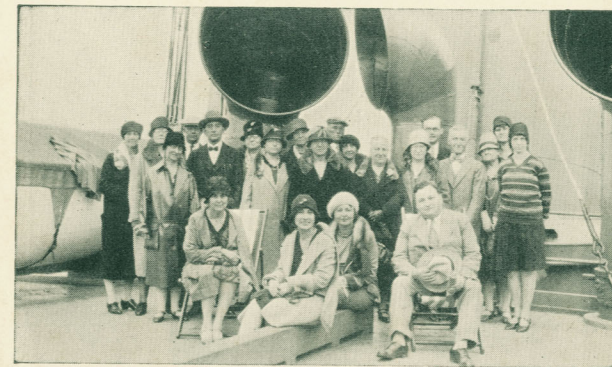
Happy hours aboard the cruise ship

All in all, these trips will provide an ideal vacation tour, combining the advantages of travel by rail and water with the educational and recreational opportunities of sight-seeing. These tours, in addition to their appeal to individuals, teachers and students, are particularly attractive to groups, such as social, fraternal or community organizations, to whom a cordial invitation is extended, with the assurance that their party will be well taken care of and given full opportunity to be together throughout the trip.