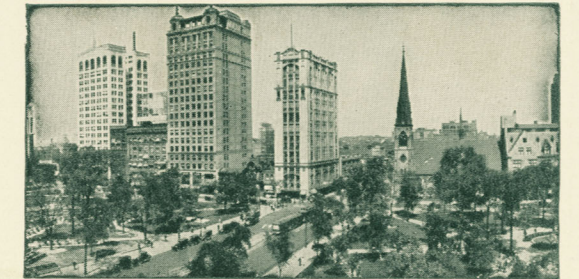
In the heart of Detroit, Mich.